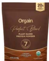
Perfect Blend Plant Protein Powder