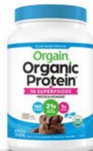
Organic Protein™ & Superfoods Plant- Based Protein Powder

Nutritional values are for the flavors shown. Values may vary by flavor.