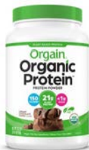
Organic Protein™ Plant-Based Protein Powder