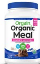
Organic Meal™ Nutrition Powder