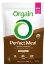
Perfect Meal™ Organic Complete Meal Replacement Shake Powder