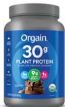
30g Plant Protein Powder