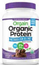
Organic Plant Protein Plus Metabolism Blend