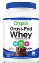
Grass-Fed Whey™ Protein Powder